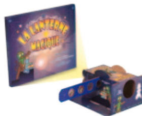
▲ 6. DS Smith Kayserberg - magic lantern