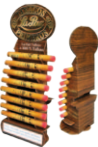
▲ 3. Cartonnage Mulliez Richebe - cigars display