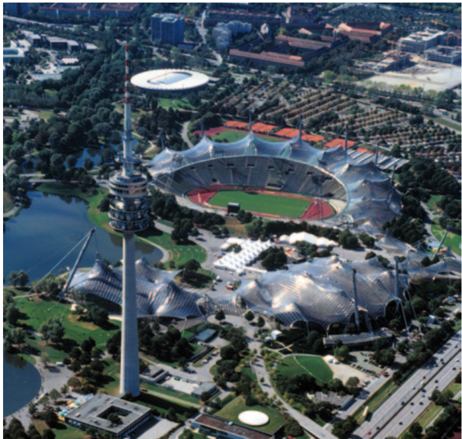
Event Arena and Olympiapark

We are pleased to remind you that the 16th Technical Seminar organised by the FEFCO Production Committee will be held on 23rd, 24th and 25th March 2011 at the Olympiapark Event Arena in Munich.