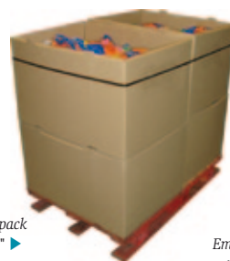
5. Saica pack "Twobox" ▶