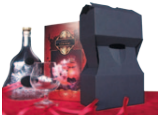
▲ 1. Saica Pack - "Fitment for Cognac bottle"

Saica Pack for its "Fitment for Cognac bottle". The attractive E flute outer was complemented by a clever inner fitment which secured the prestigious presentation bottle of cognac.