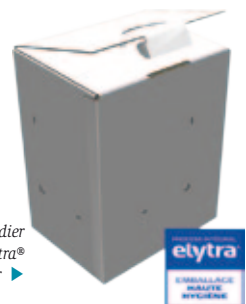
7. Emin Leydier Emballages - Elytra® mini-container ▶