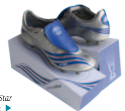
Young Corrugated Star magnetic box ▶