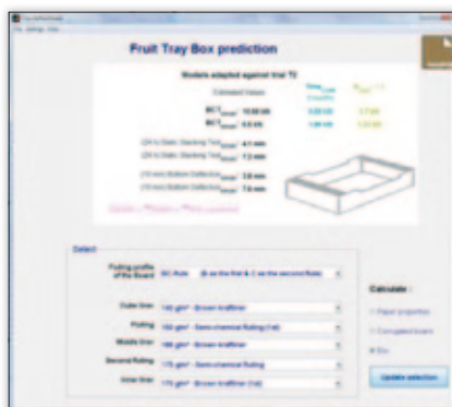
Figure 1: Example of Graphical User Interface in the ModelPACK tool

Often one of the unknowns is the length of time that a corrugated box will stand up to storage under loaded conditions, a factor that is very dependent on the paper substrates used. ModelPACK is unique in that it is the only software of its kind that also includes life length calculations for boxes. In order to achieve this, measurements of creep data for papers are included, and databases with paper and corrugated board criteria can be built up for each user. In addition, the graphical user interface shown in figure 1 can be adapted according to the needs of the user.