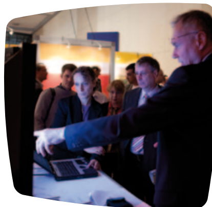
Software demo in Berlin, at FEFCO Technical Seminar.